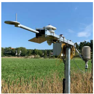
Data from test sites