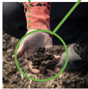
Data from farms